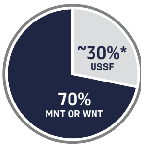
NON-WORLD CUP PRIZE MONEY